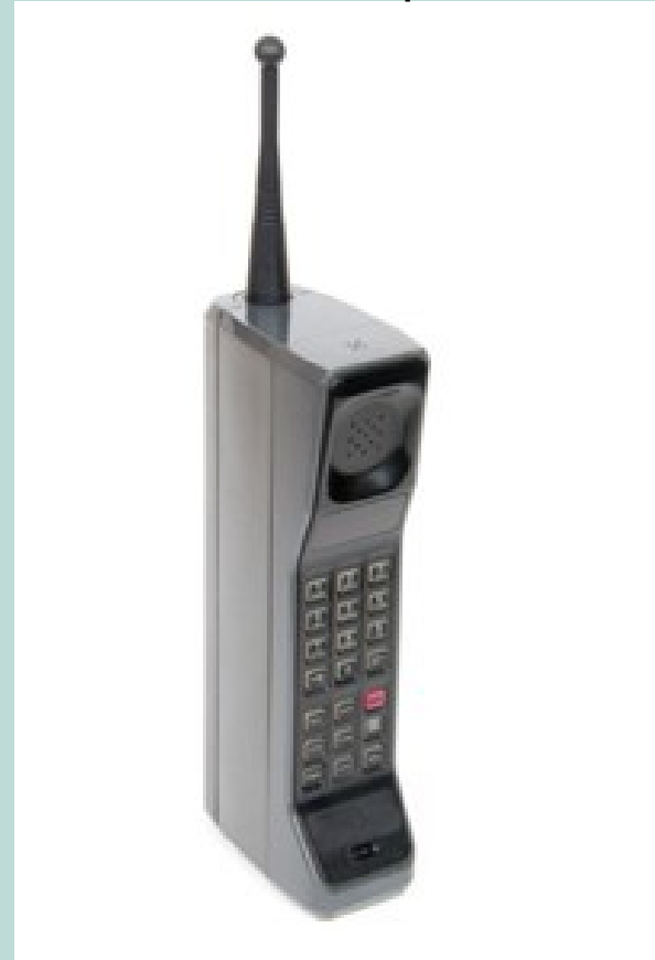
Pic3 - First cellphone