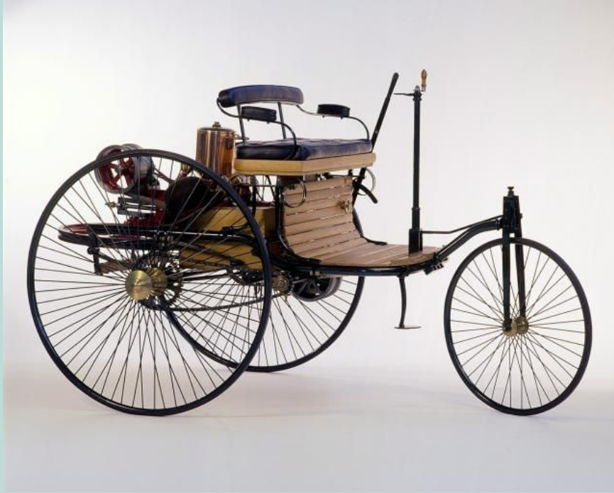
Pic1 - First car